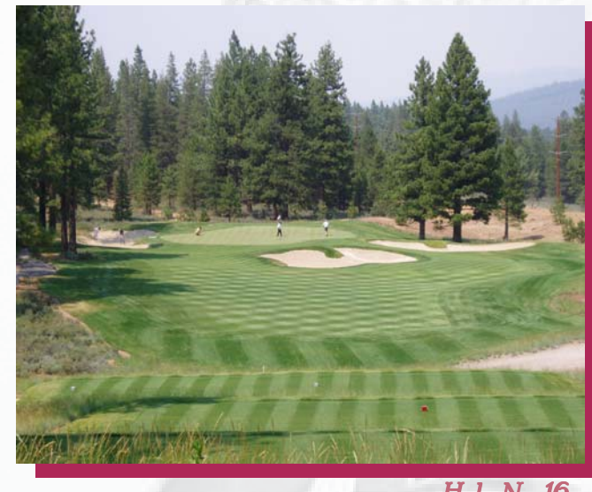
Hole No. 16

For some landscaping amenities, however, members will have to wait: Jacobsen Hardy accented its design at Gray's Crossing with seas of wildflowers, some framing holes and others intervening - such as the fairway divide on 18. You can't "sod" wildflowers, of course. Jim Hardy noted that seeded wildflower plantings will take a couple growing seasons to fully mature in Truckee. But when they do, thanks to seasonal water flow off the mountains, these wildflowers will bloom several times a year - each time in a different color, creating unusually vivid settings on an already vivid layout.