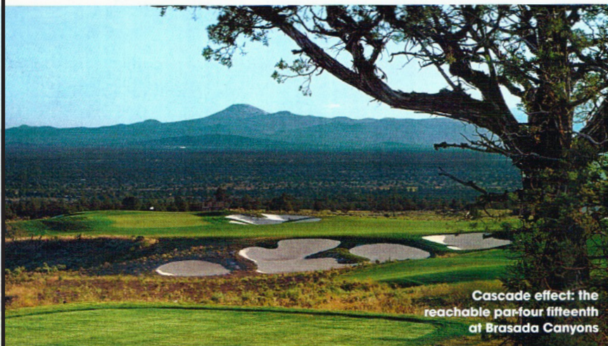
Cascade effect: the reachable par-four fifteenth at Brasada Canyons

A state-by-state guide to the most notable debuts and redesigns